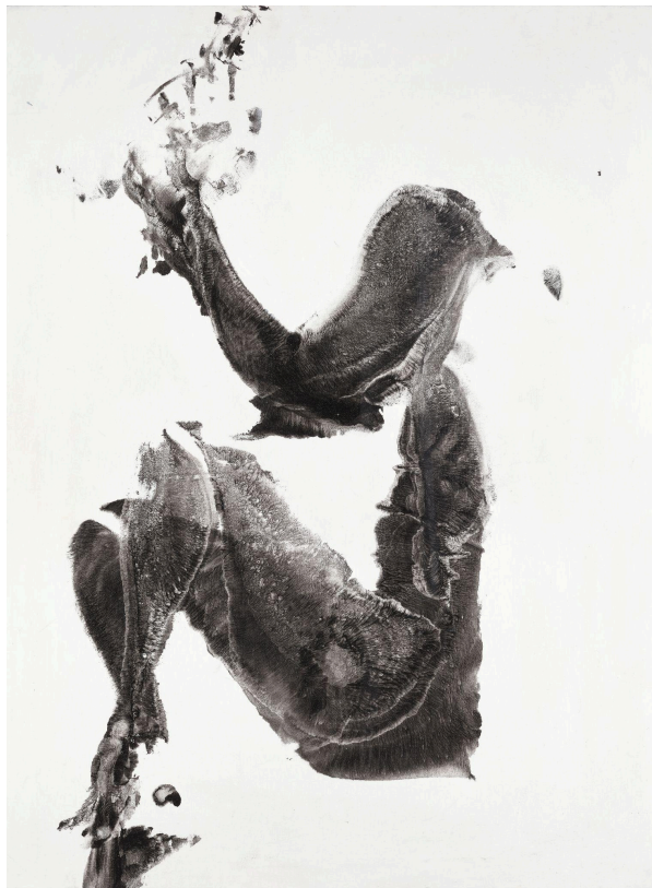
Heaven: A Moment Ago , unframed February 2022, 73cm x 97cm, Water based acrylic paint on canvas Prints starting from £100 at A4