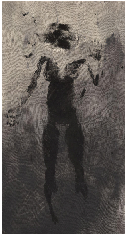
Body Prints 1 , unframed June 2023 approx 183cm x 61cm, water based acrylic paint on cotton

Heaven: A Moment Ago has been exhibited in Boomer Gallery's "What Is Art", London Bridge, June 2024 and "Art On The Top", Kingston Upon Thames, August 2025.